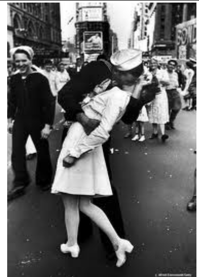
Remember VJ Day 15 August 1945