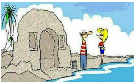
*It's a house made out of sand. What did you think I meant when I said I owned a beach house?*

It is enough to create stories to tell your grandchildren about and mark this as a “Hysterical Event” in the history of the Shameless Shamrocks. OOOH it’s a Pirates’ Life for Me!!! HO HO HO and a Bottle of Spirits.